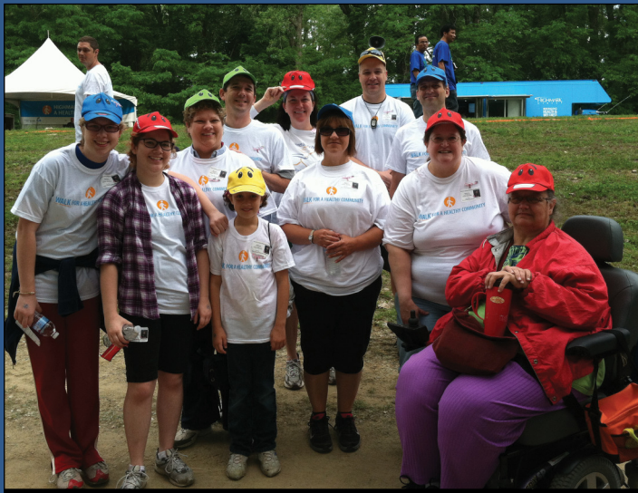
Team Christ United Methodist Church ranked as the top team, recruiting 13 walkers and raising $1,344 in donations. Way to go!

188 days and nights of shelter, basic necessities, and life skills training - that is what our amazing group of walkers and supporters accomplished through the Highmark Walk for a Healthy Community.